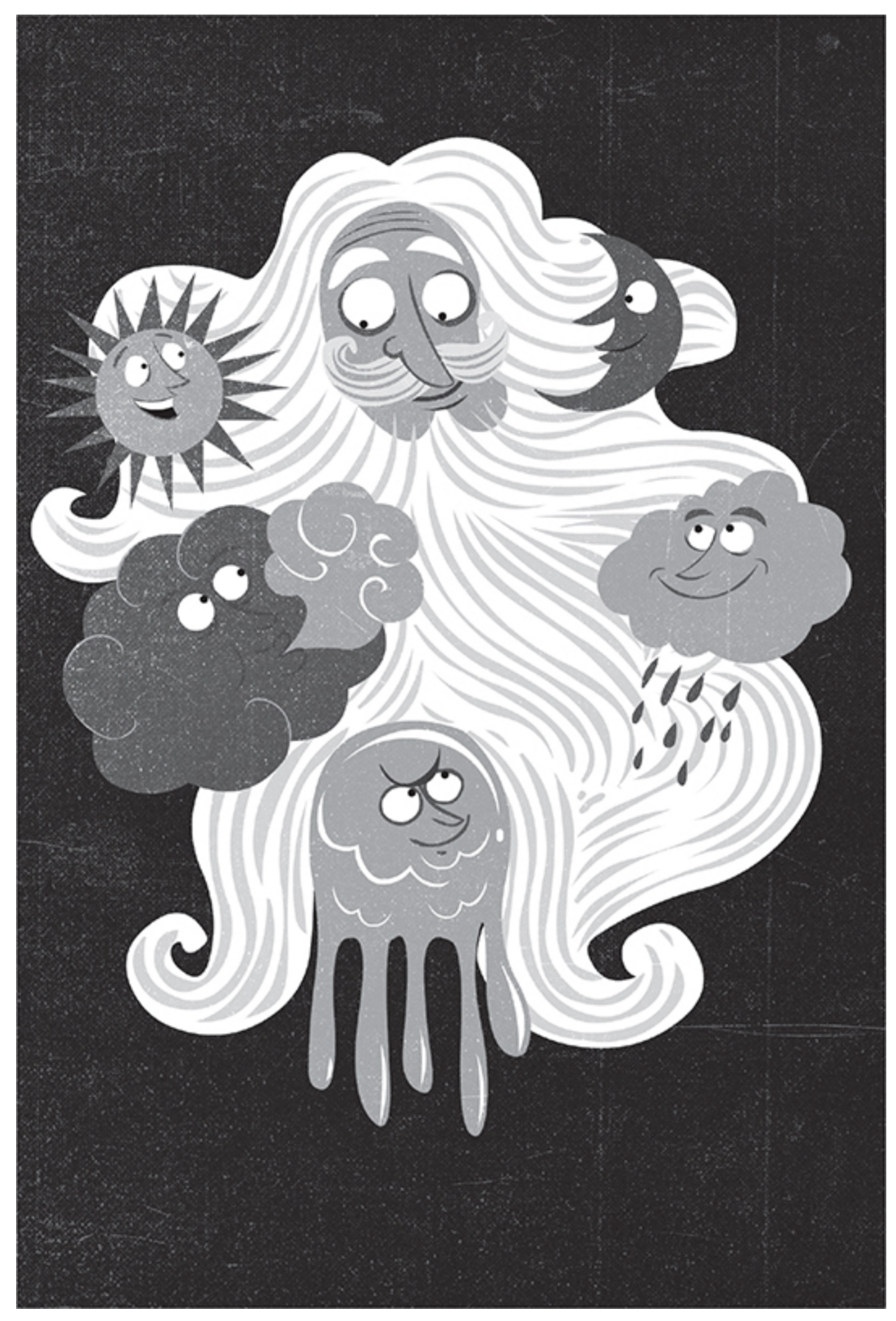
Rain said, 'If I don't show up all the water on Earth will disappear, so I will come next.'