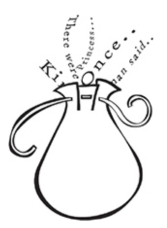
Fire on the Beard

What a grand picnic everyone had! They played and ate and splashed in the water till late evening. Ajja and Ajji had to drag them back home. That night the children tumbled into bed and were fast asleep even before Ajji switched off the lights. Quietly she tucked them in. The next morning there was no sign of anyone waking up. Ajja and Ajji went about their work, not waking the children. But when it was ten o'clock, Ajji decided they had to wake up now. So she came into the room and found all four were up and chatting in bed. She looked at them for a while with her hands on the hips. Then she said, 'So, I think you've had enough rest. Now up all of you. Wash up and get ready. I'll give you your lunch by noon.'