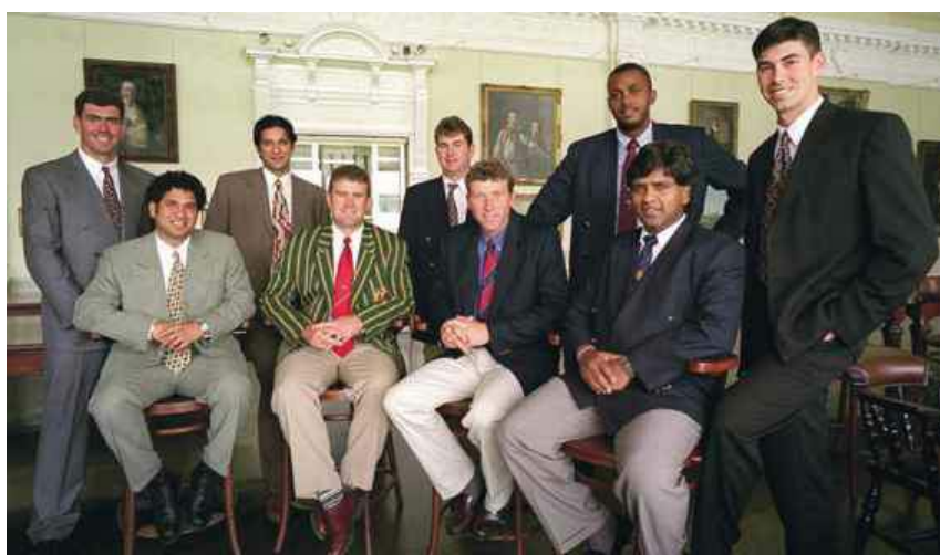
At Lord's in the famous Long Room. Captains of the world unite for an ICC meeting in 1997. From the left: Hansie Cronje, myself, Wasim Akram, Mark Taylor, Alistair Campbell, Michael Atherton, Courtney Walsh, Arjuna Ranatunga and Stephen Fleming.