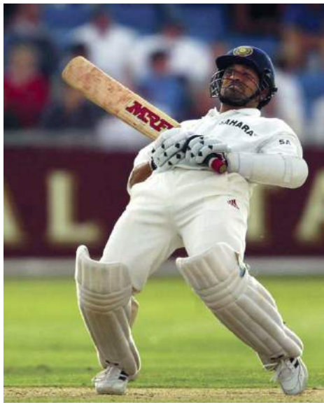
Evading a bouncer during a hostile spell from Andrew Flintoff in the third Test at Headingley in 2002.