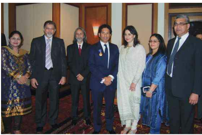
My core strengths – with my brothers and sister and their better halves after receiving the Order of Australia in 2012.