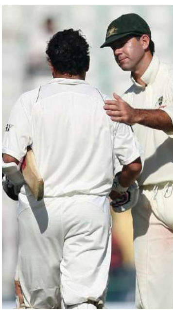
Congratulations from Ricky Ponting after I passed Brian Lara's record of Test runs at Mohali in October 2008.