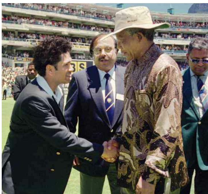
Meeting Nelson Mandela in Johannesburg in 1992. He also saw me play in Cape Town in 1997 and on both occasions I made a hundred!