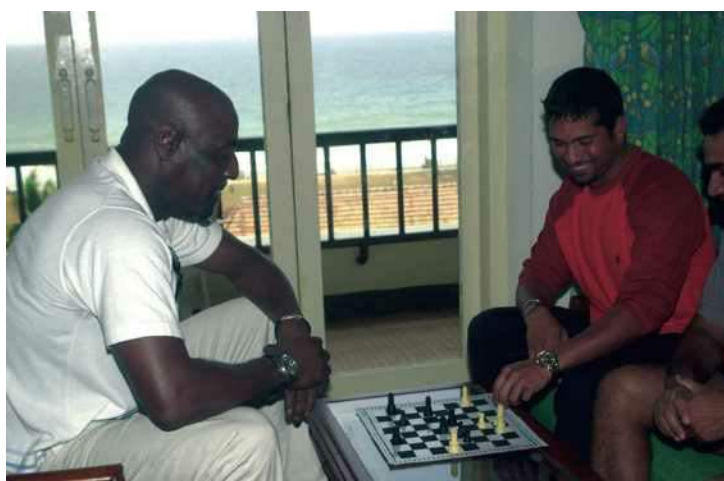
Playing chess with the legendary Viv Richards in Sri Lanka. If only I could bat like my hero!