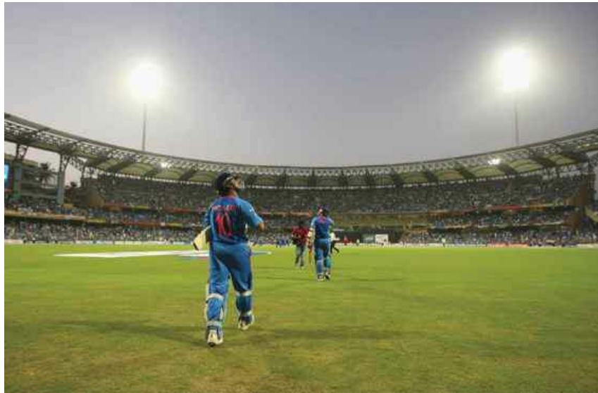
Walking out to bat in the World Cup final at the Wankhede in April 2011. That win will always remain the highest point of my career.