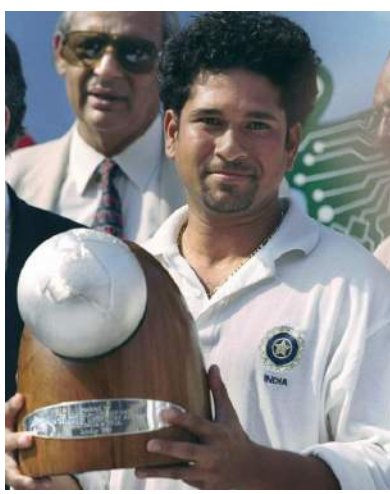
With the Border-Gavaskar Trophy in Delhi after beating Australia in October 1996 in my first Test as captain.