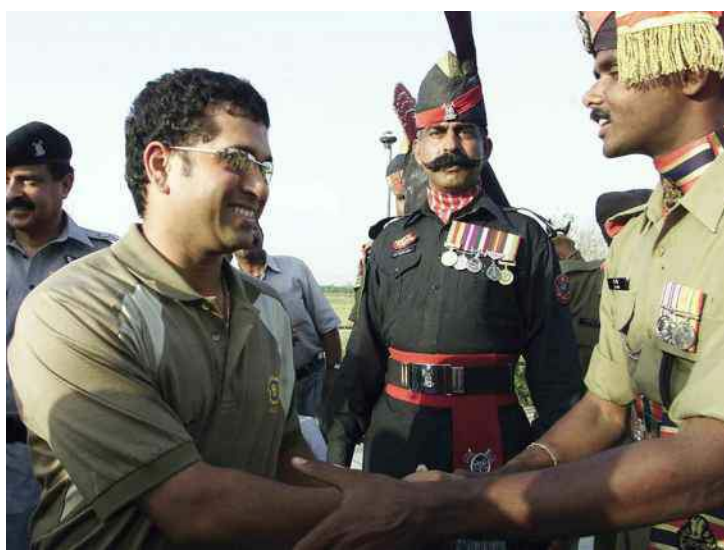
With Indian and Pakistani soldiers at the Wagah border in 2004.