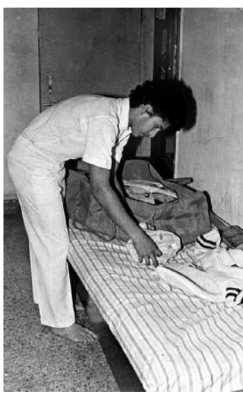
Packing my kitbag at my uncle and aunt's place in Shivaji Park as a 14-year-old. I owe them so much.