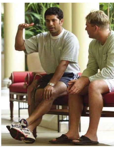
With Shane Warne in Mumbai on the eve of the first Test against Australia in the 2001 series.