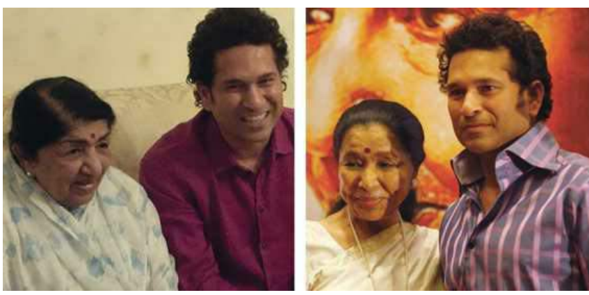
Lata Mangeshkar and Asha Bhosle: two of my all-time favourite singers. It is always a privilege listening to them.