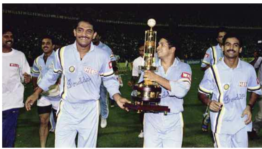
Enjoying the victory lap after winning the five-nation Hero Cup at Eden Gardens in November 1993.