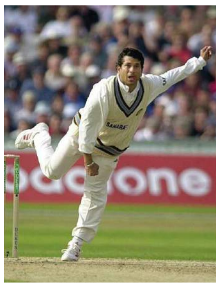
Bowling at The Oval in 2002 in what was a very exciting Test series.