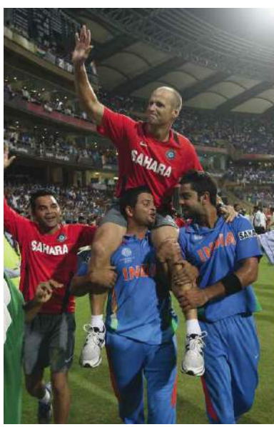
Gary Kirsten, one of the best coaches I have played under.