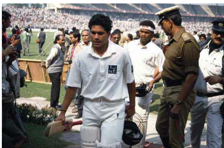
After beating England at Eden Gardens in Kolkata in 1993. Remarkably, 70,000 Indian fans had come to watch the little action that remained on the last day – such passion!