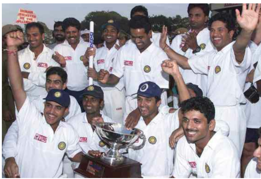
Celebrations after winning the one-day series against New Zealand in November 1999, during my second stint as captain.