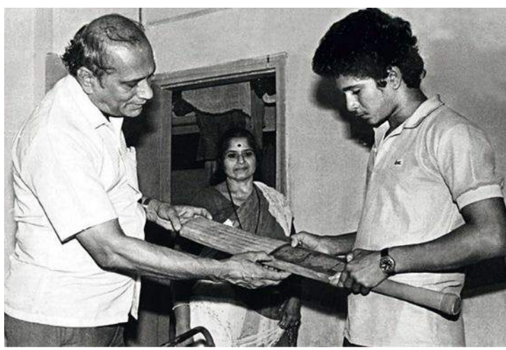
Inspecting one of my beloved bats with my father, as my mother looks on.