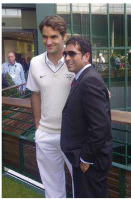
What a champion! With Roger Federer at Wimbledon in 2011.