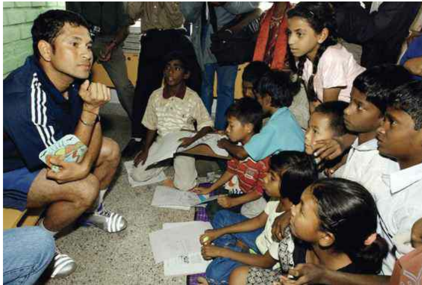
Listening to the children at a home for the underprivileged in Bangalore in 2003.