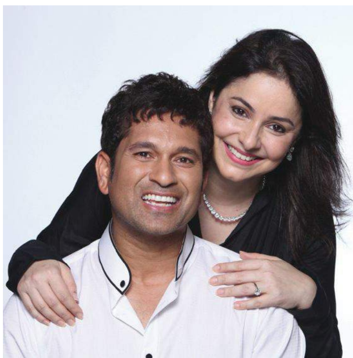
The best partnership of my life.