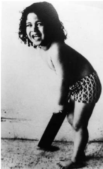
Ready to enjoy the game at the age of four.