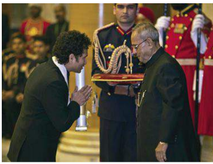
Bharat Ratna – the ultimate honour. With Honourable President Pranab Mukherjee in New Delhi on 4 February 2014.