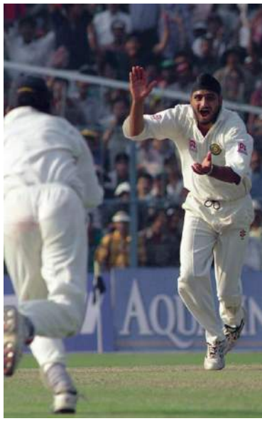
Harbhajan Singh takes India's first ever Test hat-trick at Eden Gardens in 2001.