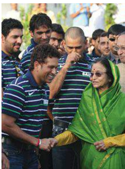
With Honourable President Pratibha Patil the day after winning the final.