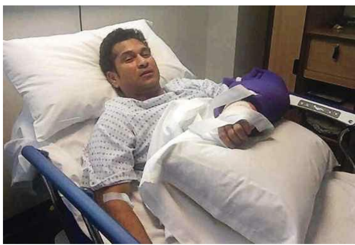
Recuperating after elbow surgery in 2005. It was the most frustrating injury of my career.