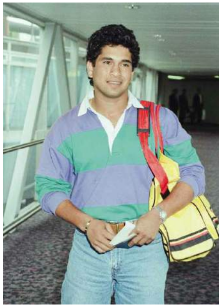
At Heathrow in 1992 on my way to Yorkshire as their first ever overseas and non-Yorkshire player.