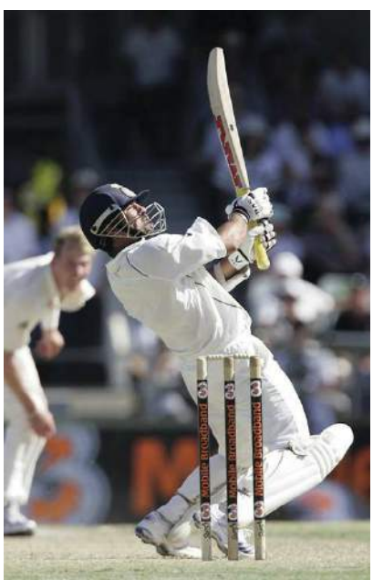
Playing an upper cut to Brett Lee on the way to a very satisfying 154* at Sydney.