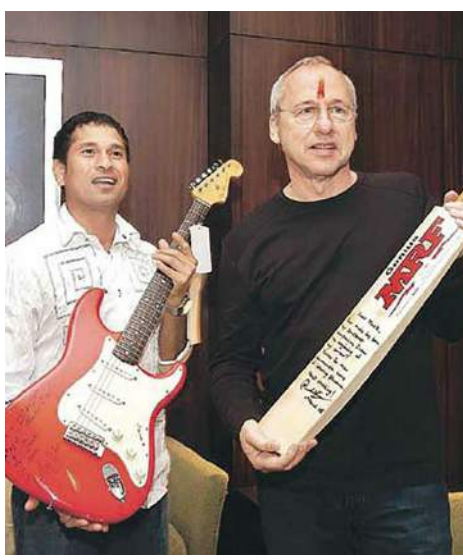
With Mark Knopfler of Dire Straits, one of my all-time favourite bands, in Mumbai. I treasure the guitar he gave me.