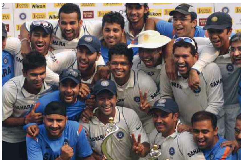
Another peak scaled. We are the number one Test side after beating Sri Lanka in Mumbai in 2009.