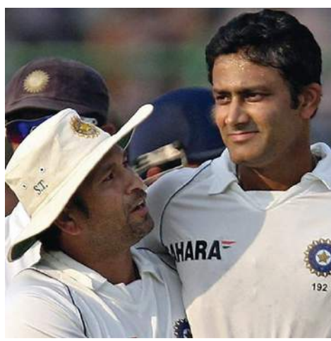
Above: With Anil Kumble: one of the best triers on the field.