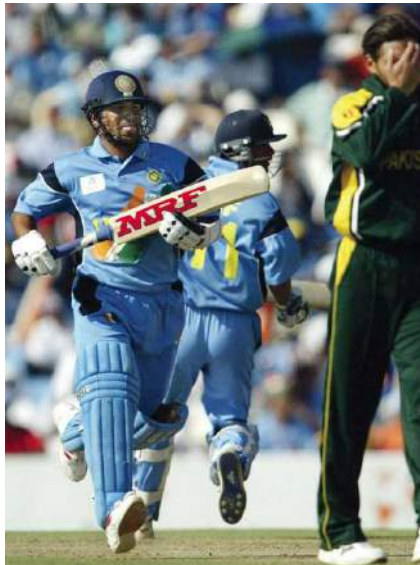
Battlefield Centurion: on my way to 98 in the much-anticipated clash with Pakistan in the 2003 World Cup.