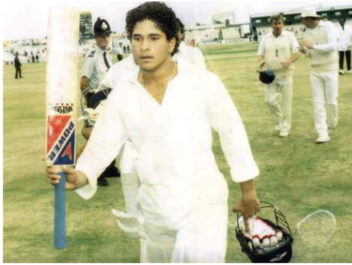
After my first Test hundred, at Old Trafford in 1990. Little did I know that there were 99 to follow!