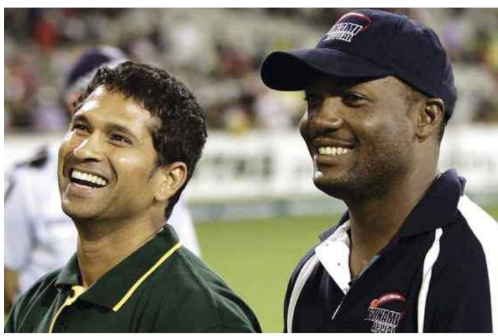
With one of the best batsmen of all time and a very good friend, Brian Lara.