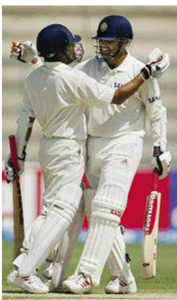
Congratulating Virender Sehwag on reaching 300 in Multan in 2004 – a terrific Test innings.