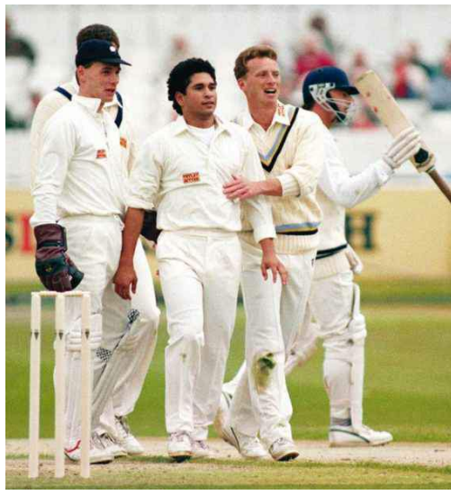
Celebrating with my new team-mates after taking a wicket in my very first county match in 1992.