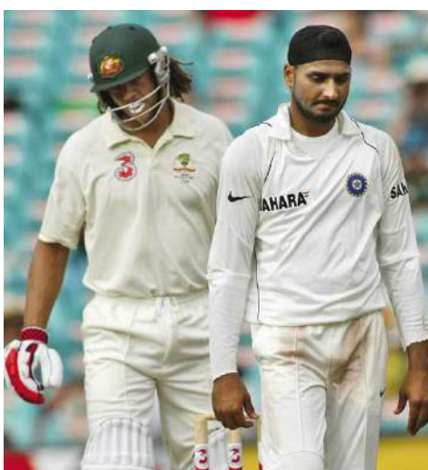
Andrew Symonds and Harbhajan Singh during the controversial Sydney Test in January 2008.